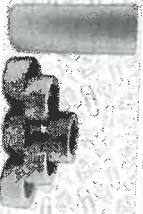
Tape Masking, Width: 49mm (Astim)

Item Code : 312515Q3-TA-M02 Item Category : Unit of Measure : ROLL Available Quantity in Depot: Out of Stock Available Quantity in APP-CSE : 662