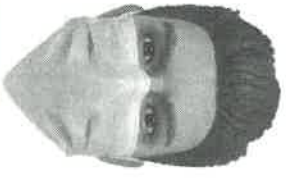
Surgical Mask, 3-ply

Item Code : 42131713-SM-M01 Item Category : Covid 19 Response ... Unit of Measure : PIECE Available Quantity in Depot: Out of Stock Available Quantity in APP-CSE : 12310